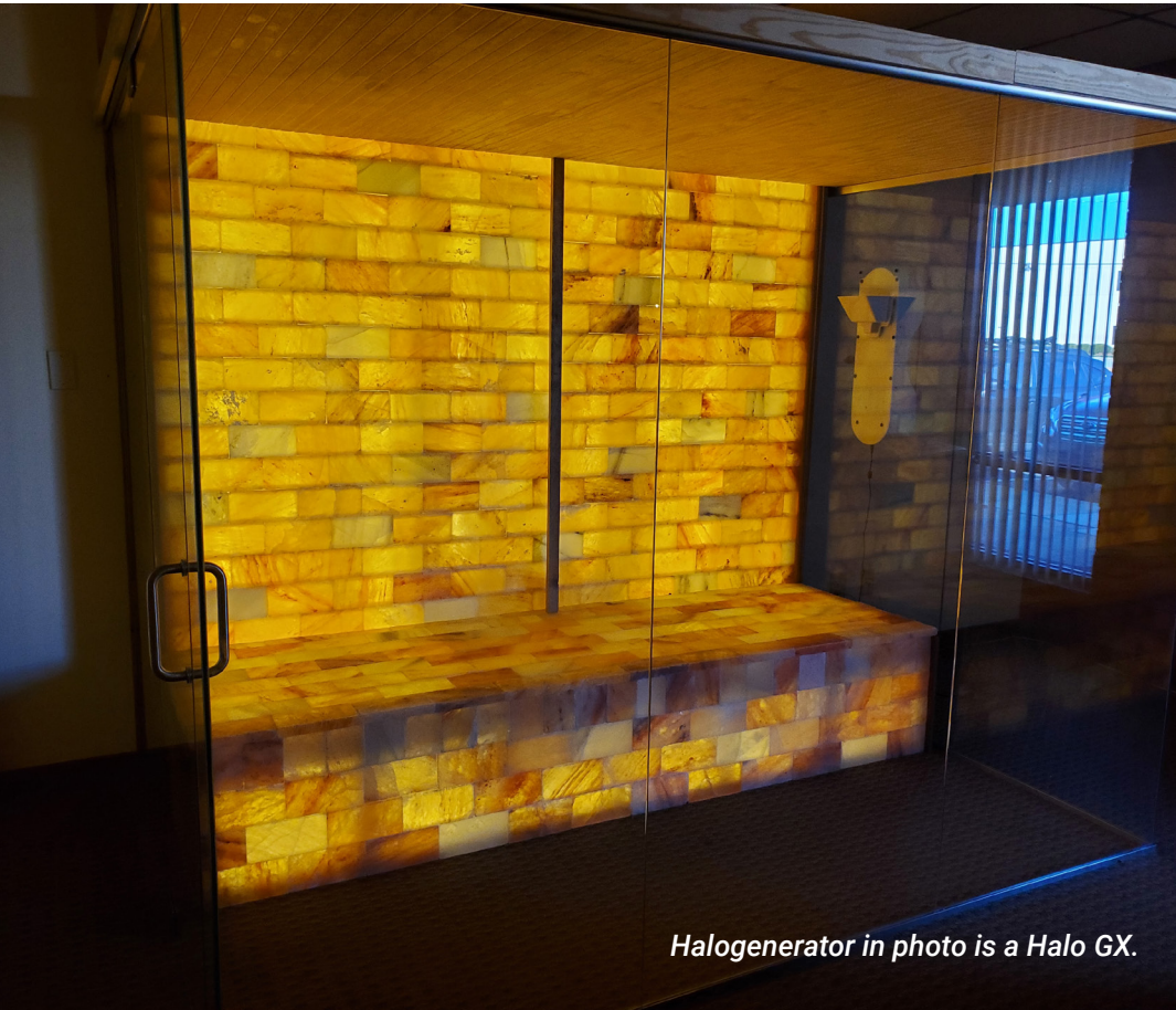
Halogenerator in photo is a Halo GX.

Pay this unit off in as little as 10 weeks with 70% utilization – no commission necessary – paying pennies for pharma grade salt!