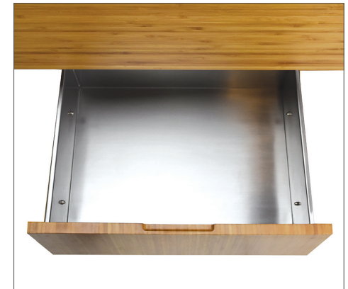
Warming drawer keeps towels and heat transferring products warm and ready.