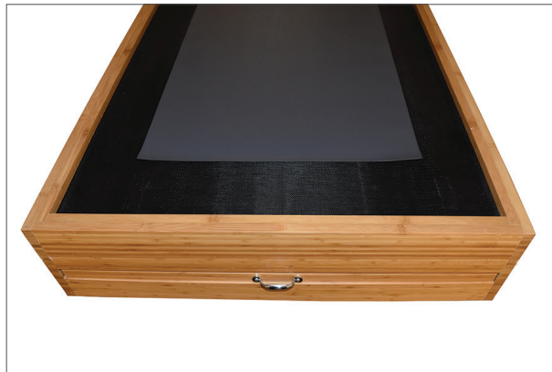
Professional-grade 220-watt heater rests under the salt, providing warmth and releasing the salt's healing negative ions.